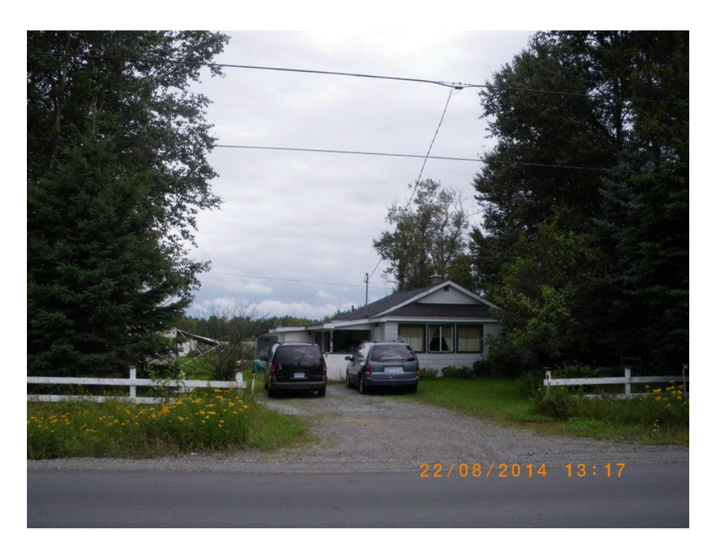
PHOTO 1 880 GRAVEL DRIVE, HANMER – PRIMARY DWELLING ON THE SUBJECT LANDS VIEWED LOOKING NORTH FROM GRAVEL DRIVE