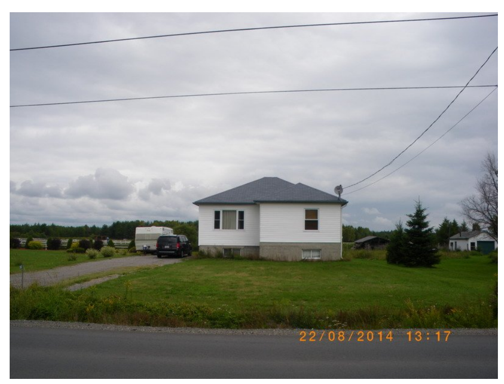
PHOTO 2 GARDEN SUITE ON SUBJECT LANDS, LOCATED WEST OF THE PRIMARY DWELLING, VIEWED LOOKING NORTH FROM GRAVEL DRIVE