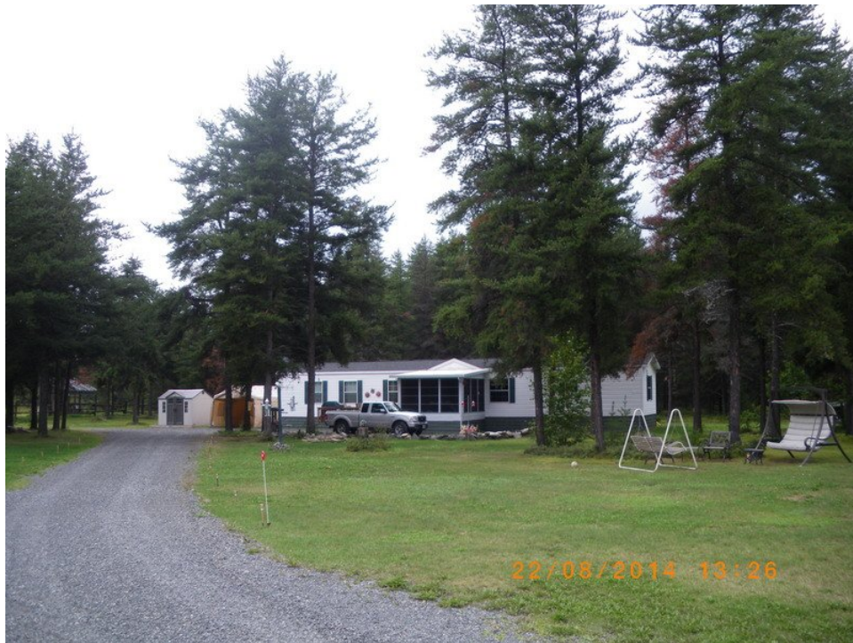
PHOTO 2 GARDEN SUITE ON SUBJECT LANDS LOCATED SOUTH OF THE PRIMARY DWELLING