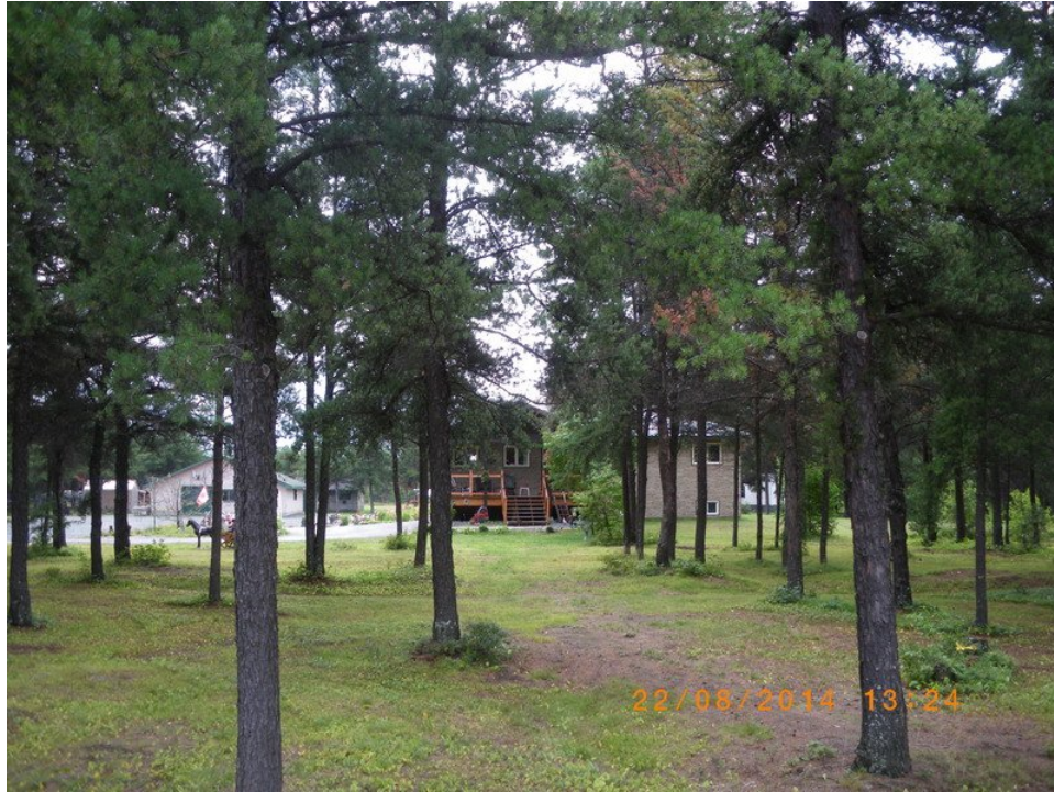
PHOTO 1 SUBJECT LANDS, 277 LINDEN DRIVE, HANMER VIEWED LOOKING SOUTH FROM LINDEN DRIVE