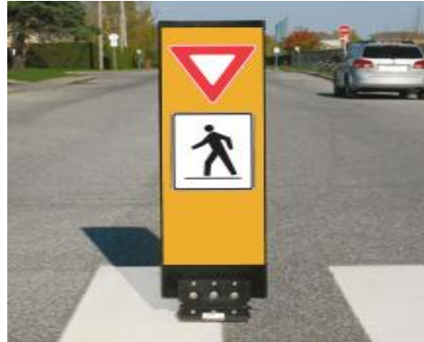
Figure 2: Flexible Bollard

In an effort to improve compliance at Type D PXOs, staff will be trialing a new flexible bollard as shown in Figure 2 below.